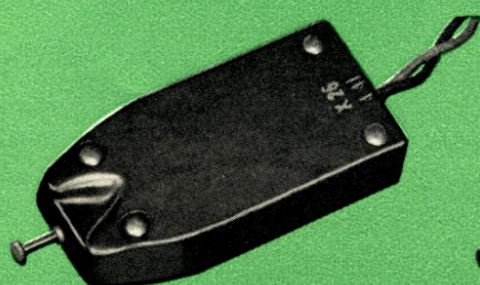
MODELS X-26 AND X-29A